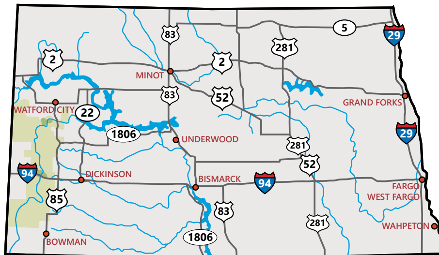
Council members represent large and small communities across the state.